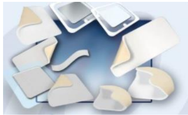
17- Foam Products