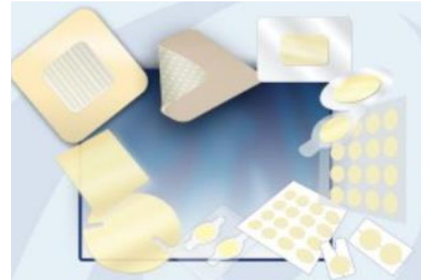
15- Hydrocolloid Products