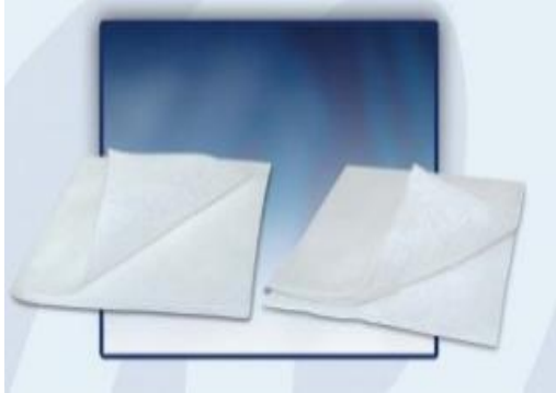
1- Low Adherent Absorbing Dressings