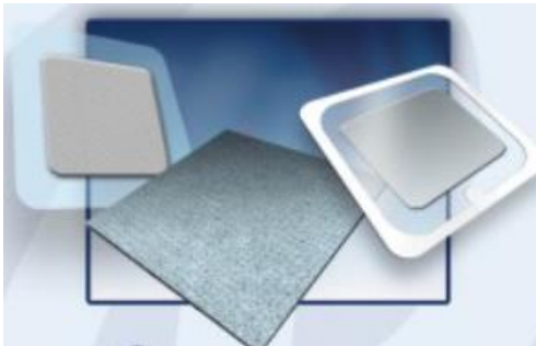
22- Deodorizing Wound Dressings