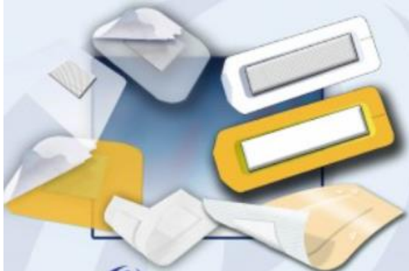
8- Post operative Dressings