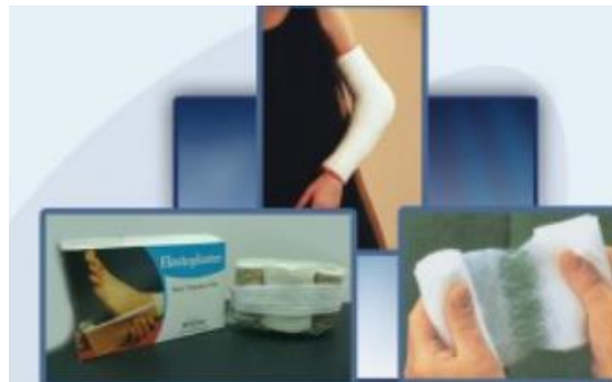
5- Casting and Bandaging