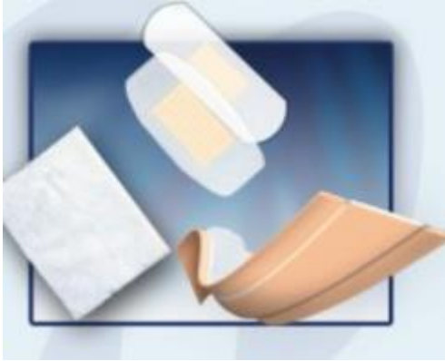
19- Haemostatic Wound Dressings