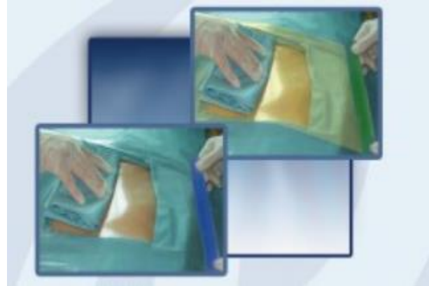
14- Incise Drapes