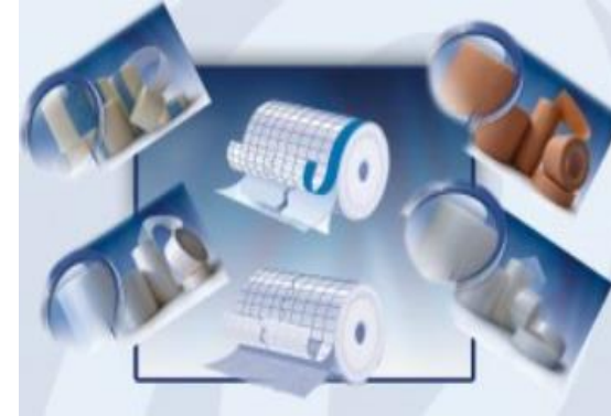
3- Medical Adhesive Tapes