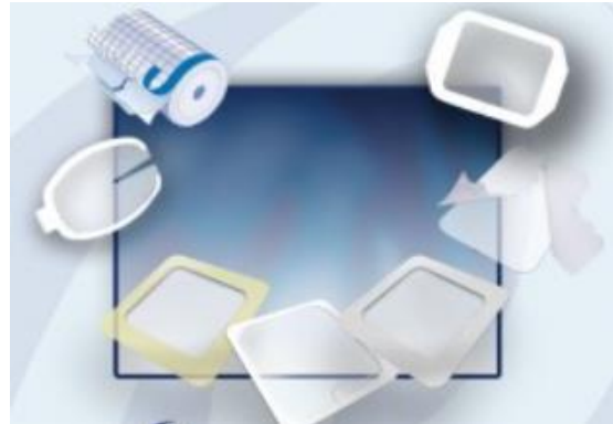
20- Transparent Film Dressings