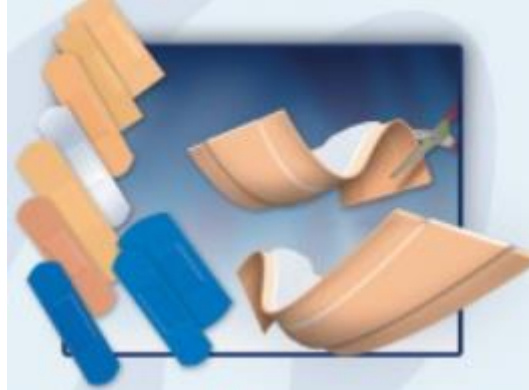
2- First Aid Bandages