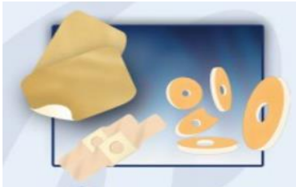
11- Foot Care Products