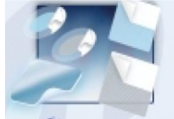
9- Hydrogel products