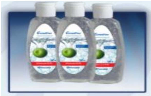
16- Hand Sanitizer Gel