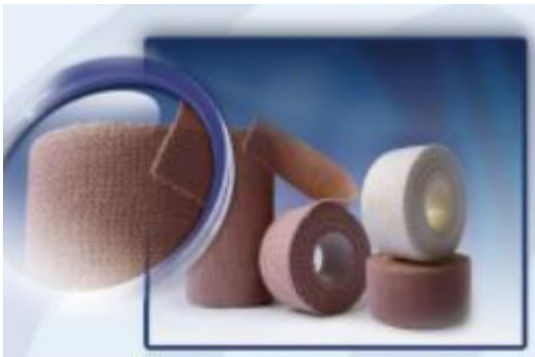
4- Compression Products