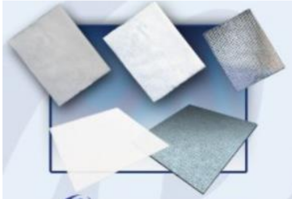
13- Non-Adherent Dressings