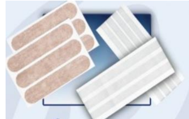
21- Skin Closure Strips